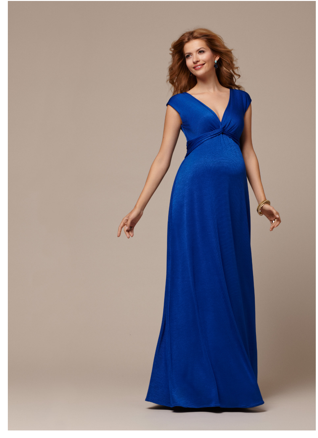
\cdot Clara gown cobalt blue \sim \it{\ell}250 \cdot