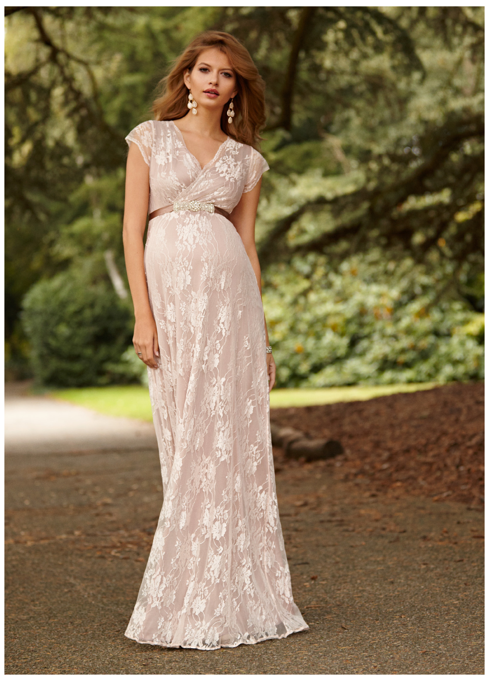
• EDEN GOWN BLUSH \sim €315 •