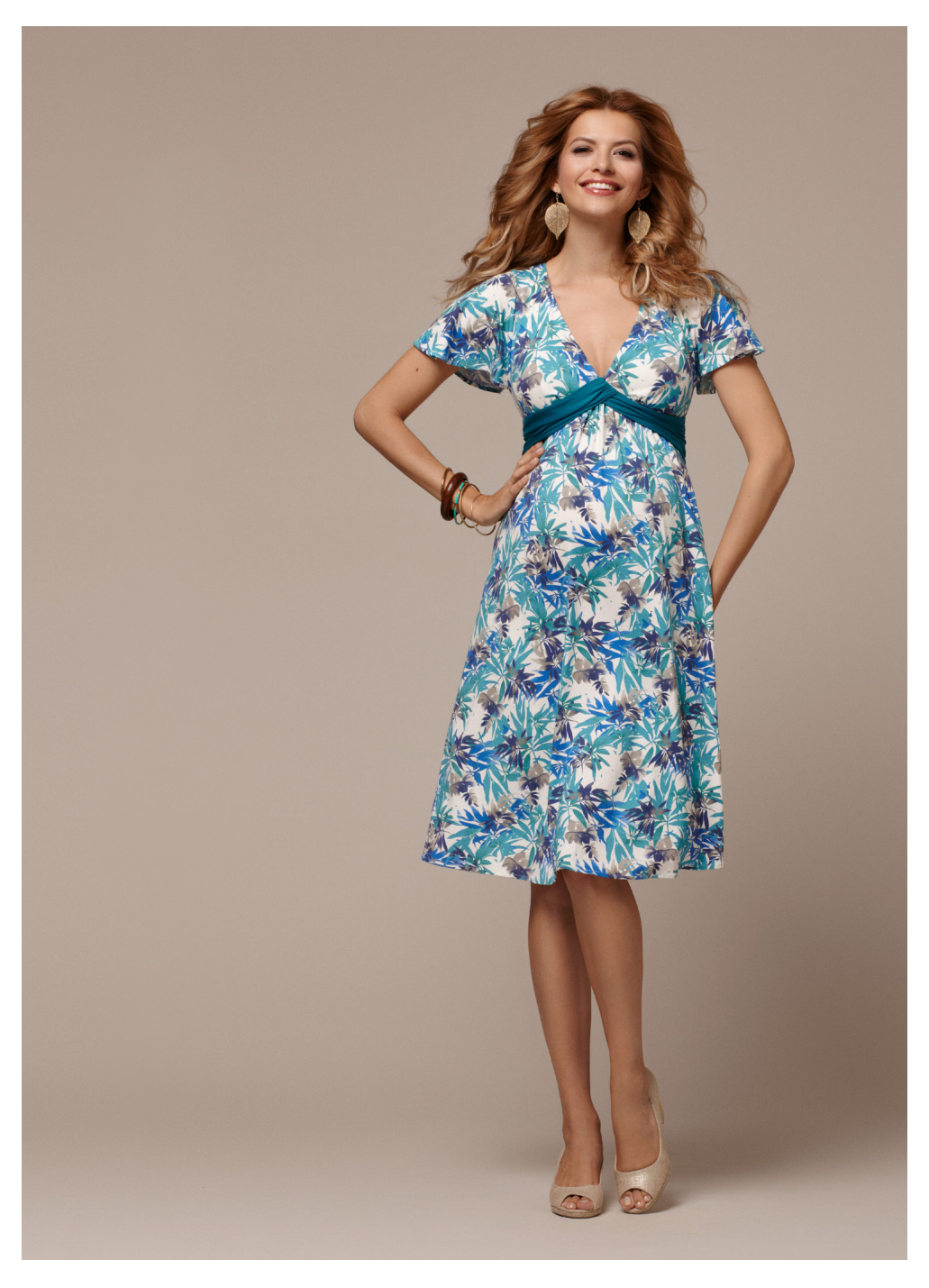
• LIZZY DRESS BLUE NILE \sim €150 •