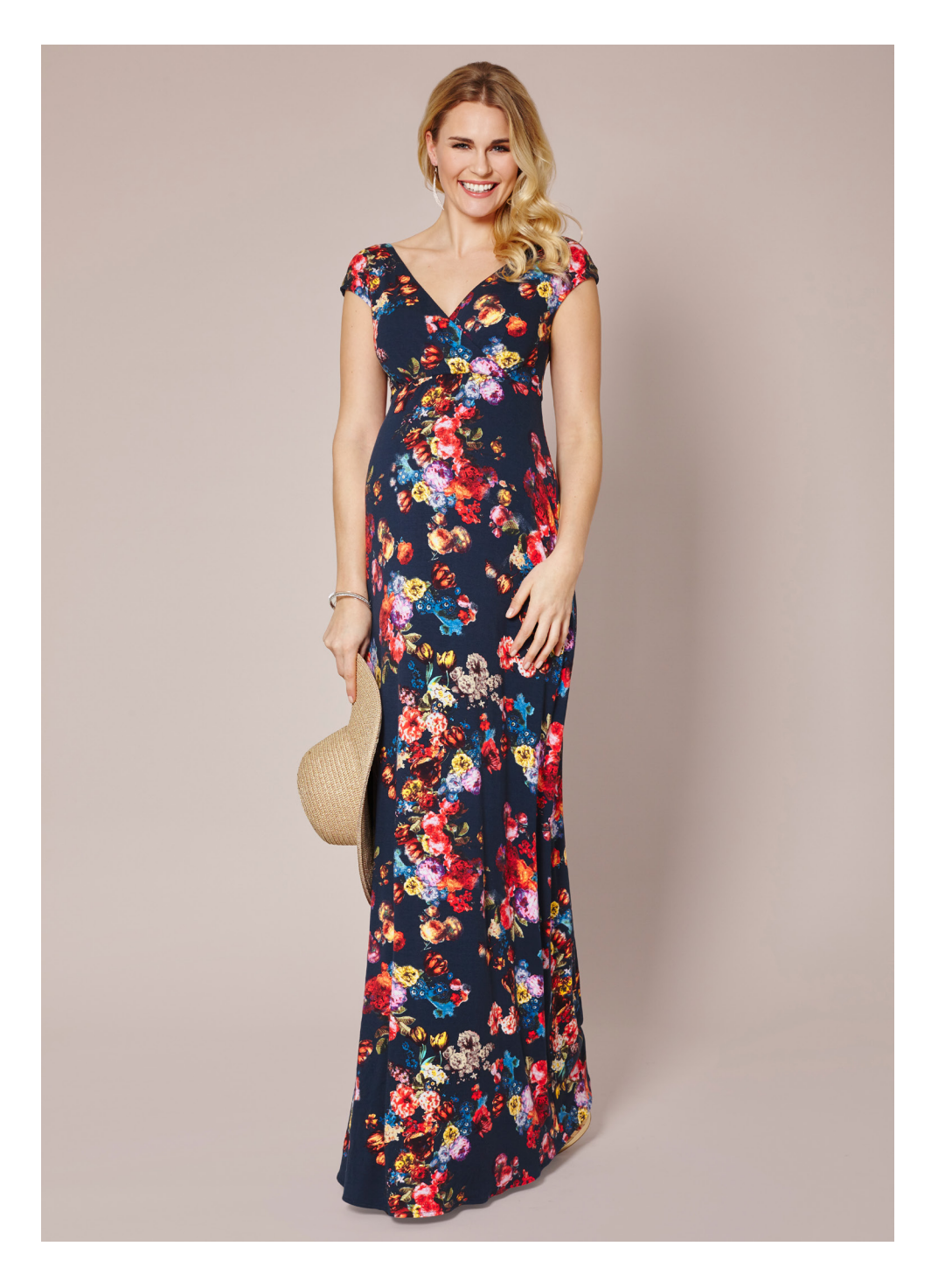
• FLORAL MAXI DRESS MIDNIGHT GARDEN \sim \ell 140 •