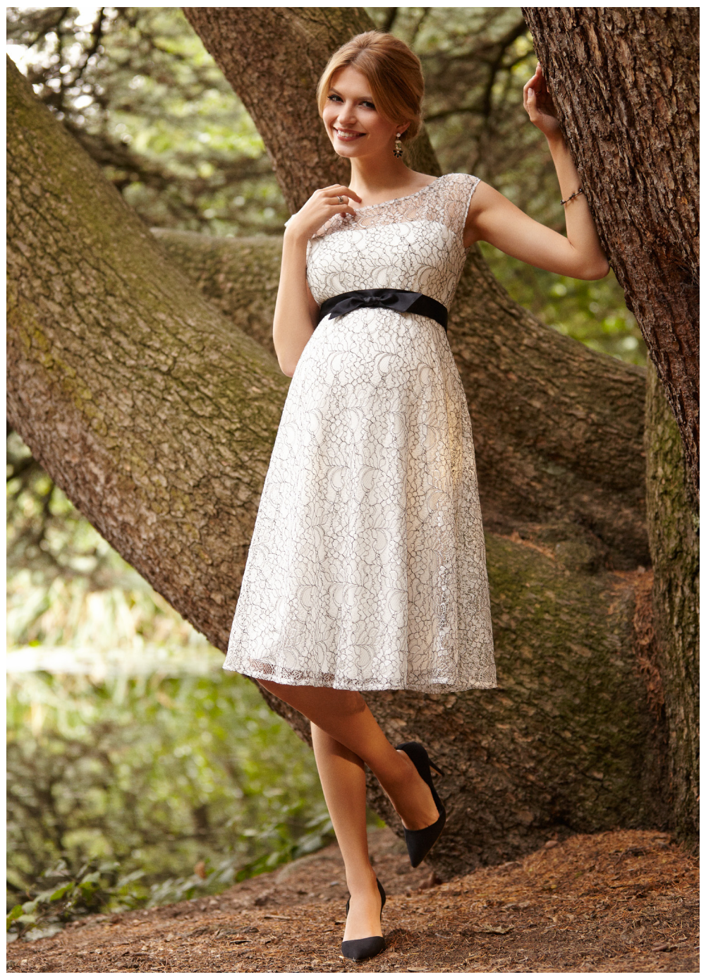
• DAISY DRESS MONO LACE \sim \pounds 190 •