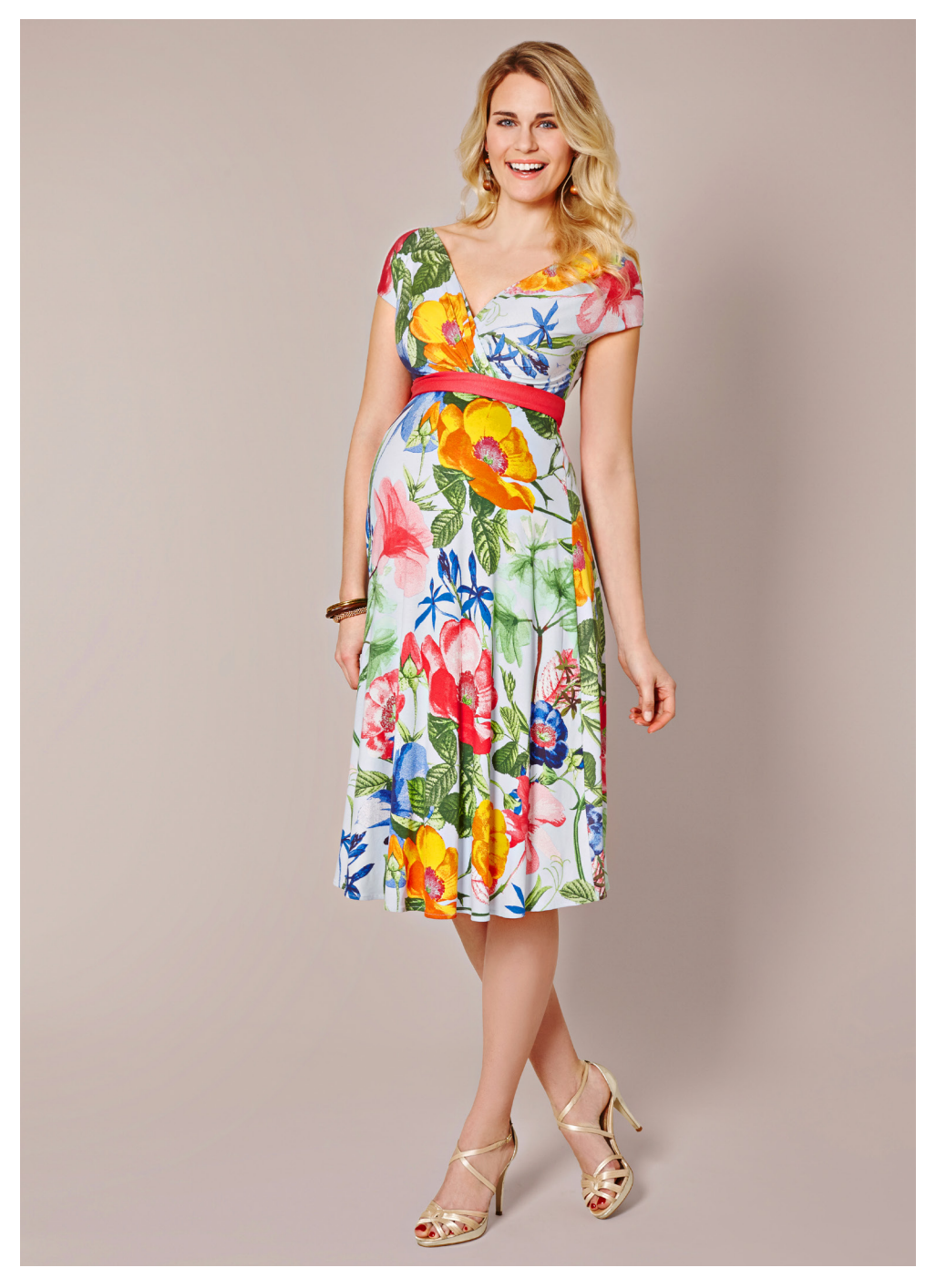
• HAWAIIAN BREEZE DRESS \sim \ell 125 •