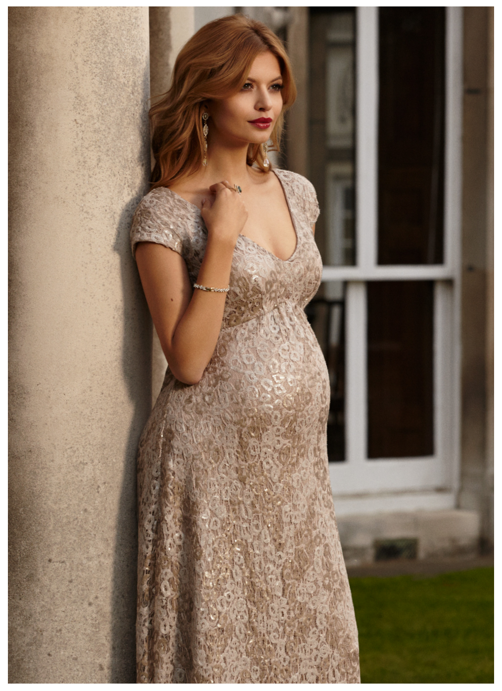
• CARMEN GOWN GOLD RUSH \sim \it e365 •