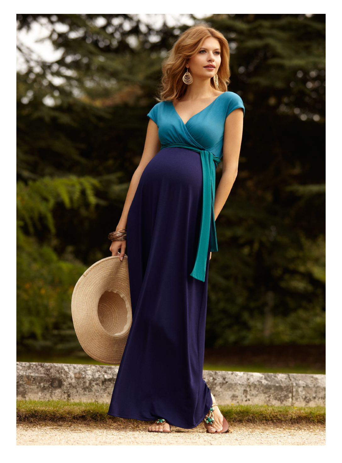
• JEWEL BLOCK DRESS BISCAY BLUE \sim \pounds 115 •